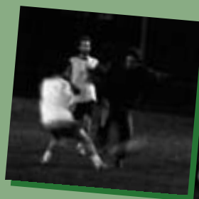
Above: in the thick of the nail-biting action; right, the opposing teams unite for a beer

In the second half, the DKFZ team fought